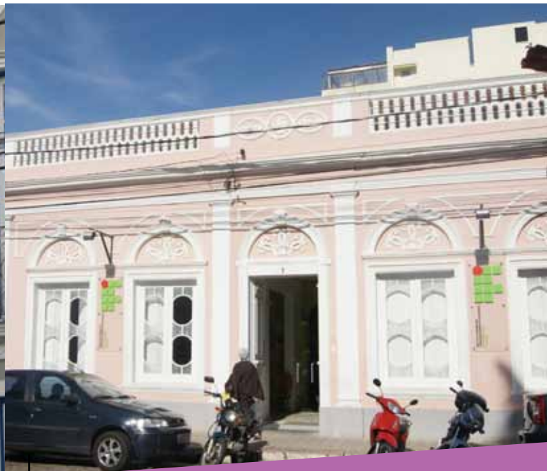
Praça José Bonifácio, nº 1