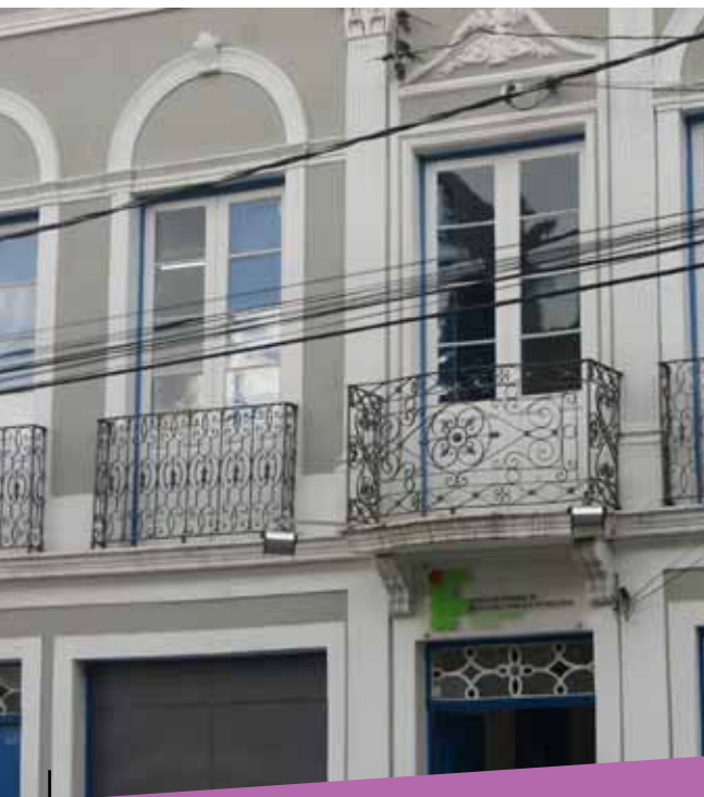
Praça José Bonifácio, nº 3