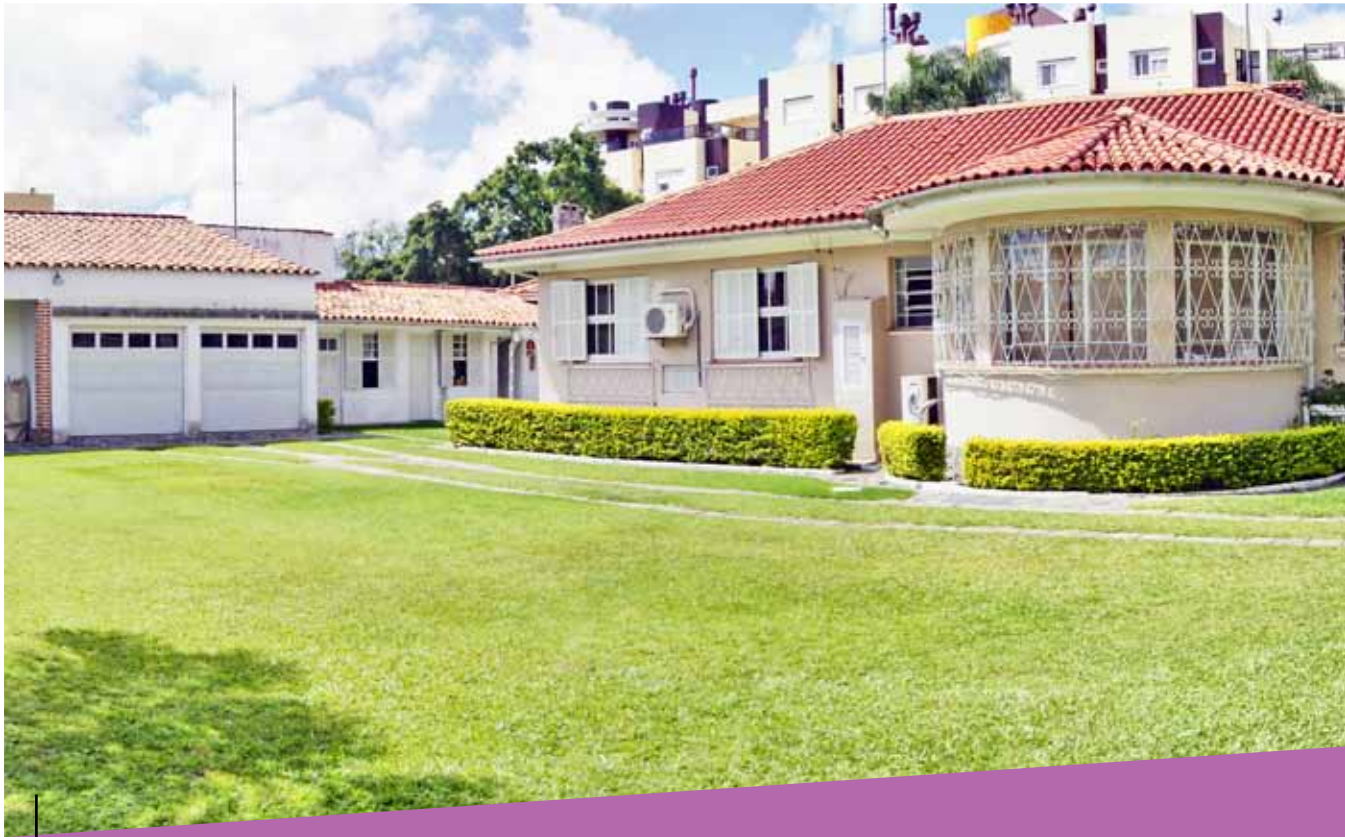
Rua Gonçalves Chaves, nº 3798