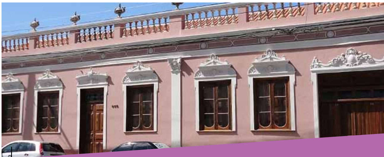
Rua D. Pedro II, nº 855

Address: Praça José Bonifácio, nº 1 Centro – Pelotas – Rio Grande do Sul – Brazil – CEP 96015-170 Telephones: +55(53) 3026-7243 and +55(53) 3026-7244 E-mail: dirai@ifsul.edu.br