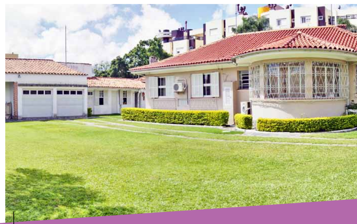
Rua Gonçalves Chaves, nº 3798

Telephone: +55(53) 3309-1750 e-mail: reitoria@ifsul.edu.br